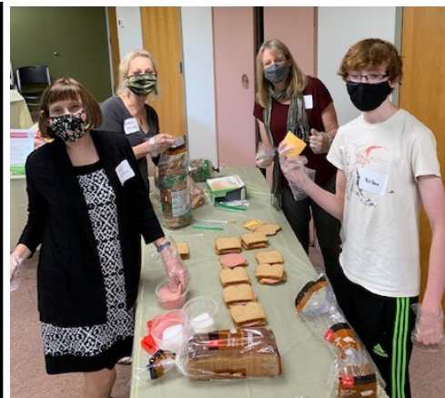
Sandwich-making on Rally Sunday 9.26.21

Solid Ground was founded by a group of dedicated women in suburban Ramsey and Washington Counties who wanted to help low income mothers in their community and incorporated as East Metro Women's Council in 1987. In 1993, East Metro Place opened its doors, providing affordable housing and supportive programs to twenty families experiencing homelessness, where they could stay for up to two years while they worked towards self-sufficiency. The location, right next to Century College, was chosen so that parents could have easy access to education, which is a key component in escaping poverty. Since first opening its doors, the organization has expanded to house over 70 families at a time in suburban Ramsey and Washington Counties. In 2013, East Metro Women's Council legally changed its name to Solid Ground, to capture their work in helping families build a strong foundation for their future.