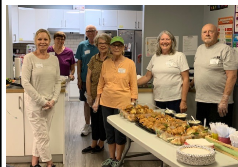
Above: Serving dinner at Solid Ground 7.14.21

Date/Time: November 10 and December 8 , 2021. Food is prepared off-site and brought to East Metro Place about 4:30 pm with meal service from 5—6:30 pm. Sign up to join the team in the Narthex or send an email to lori.mcbride@wblumc.org